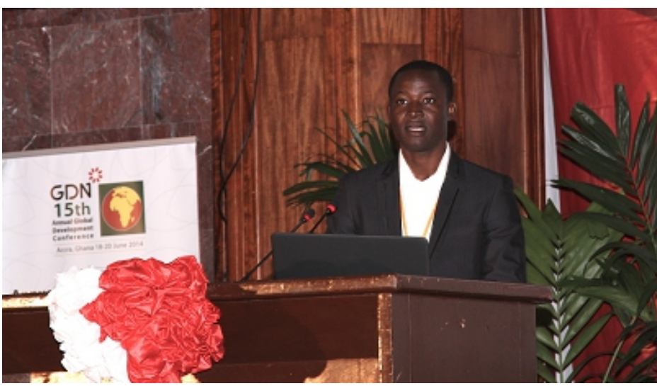
A young researcher makes a presentation at the Conference.